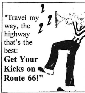
"Get Your Kicks On Route 66" - Words and music by Bobby Troup - 1946

FOR DETAILS, WRITE TO CREATIVE PRESENTATIONS 3710 N. DIVIS AVENUE BETHANY, OK 73008