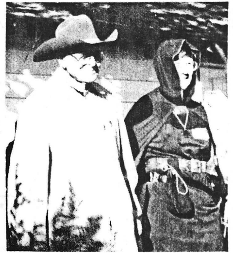
The costumes were great. Yes, it was cold and windy, but we all had fun finding the ghost of "66".