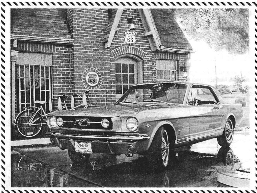
1966 Mustang GT Coupe (Value: approx. $10,000)

There will be lots of door prizes for those cruisers who complete the cruise, turn in valid passports, and are present for the closing ceremonies. The Grand Door Prize will be a 1966 Mustang Coupe! See reverse side for registration form and visit our web site at www.oklahomaroute66.com for more information.