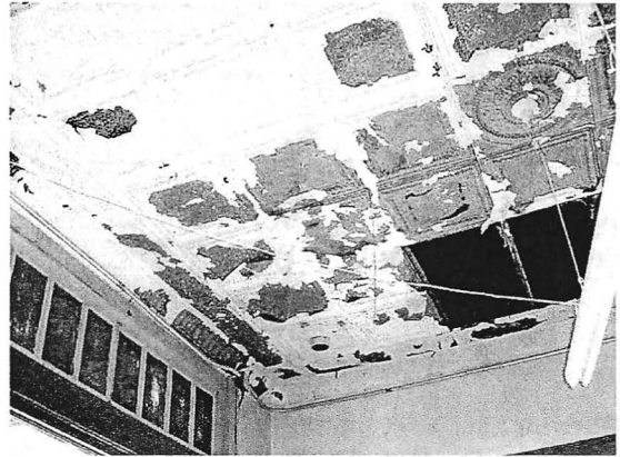
Tin ceiling, before restoration.

Getting to that point will take time. Right now, Laurel is excited about a recent sandblasting project that removed layers of old paint from the outside of the building. The next step is to give the building a fresh coat of paint.