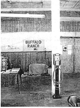
Portion of interior. Wainscoting installed but no repairs or paint above it yet. New floor must be installed too.

For more information about Afton Station, David's Packards or Laurel's postcard collection, visit http://www.postcardsfromtheroad.com .