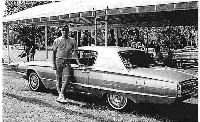
Winner of the '66 T-Bird - Kelly Kinsey.

Be sure to check out our web site for more photos from the 2002 cruise!