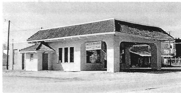
View of Afton Station from 66.

For want of a better term, Laurel is calling Afton Station a "visitors' center -- but unofficial. Completely unofficial."