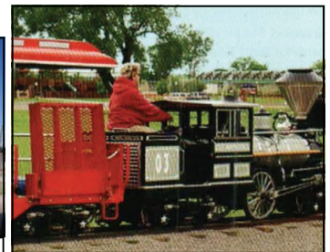
Acme Brick Park And Centennial Train