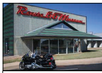
OK Route 66 Museum

Well done Clinton, OK, and hats off to the Clinton Chamber of Commerce. See you on the Mother Road.