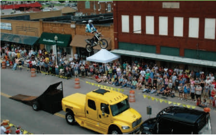
Downtown & McLain Rodgers Park Clinton, OK Phone: 580-323-2222

Get your kicks on Route 66 with festivities that include a car and bike show, poker run, free concert, vendors, Wiener National dog races, free hot dogs and more. The annual Clinton Route 66 Festival invites visitors to compete or simply browse through the contestants in the Route 66 Car, Truck and Bike Show. Car categories include original and modified vehicles from 1900 to present. Antique motorcycles, custom bikes, vintage trucks and more will all be on display. Come to the Clinton Route 66 Festival Friday night for a free concert, downtown cruise and burn-out contest in the heart of downtown. Free Bar-S hot dogs and soda will also be served.