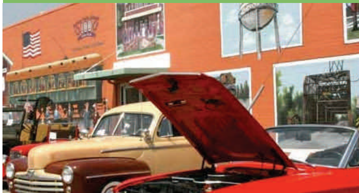
Downtown Bethany, OK 73008 Phone: 405-312-0155

The Bethany 66 Festival is a family-friendly event featuring food, downtown sidewalk sales, antiques, commercial exhibits and children's activities. Browse through rows of classic cars in the Diffie Motor Car Show and enjoy a myriad of live entertainment acts in the on-site entertainment tent. The Bethany 66 Festival also features arts and crafts vendors and live music throughout the day.