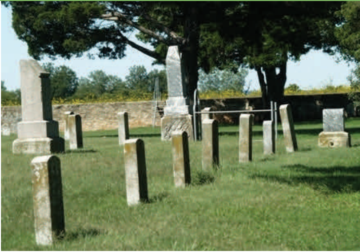
Historic Fort Reno 7107 W Cheyenne St El Reno, OK 73036 Phone: 405-262-3987 Fax: 405-262-0133

Come along on an exciting and spooky ghost tour at El Reno's historic Fort Reno. This ghost tour includes plenty of ghost stories and demonstrations by paranormal studies groups. Take a walking tour of this historic area and listen as knowledgeable guides provide information on Fort Reno's haunted past and present. Fort Reno is also famous for the African American Buffalo Soldiers that were stationed there, its role in the Land Run of 1889 and as an historic location for German POWs during WWII.