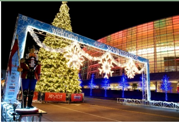
Downtown Tulsa, OK 74103

Downtown Tulsa is transformed into a festive wonderland during Winterfest,. Experience the thrill of outdoor ice skating, see Oklahoma's tallest outdoor Christmas tree, take a ride in a horse-drawn carriage, listen to live entertainment and browse beautiful holiday light displays.