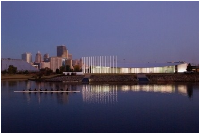
Boathouse District on the Oklahoma River 725 S Lincoln Blvd Oklahoma City, OK 73129

Join the celebration of rowing, kayaking, dragon boating and stand-up paddle boarding at the Oklahoma Regatta Festival. This four-day event offers plenty of fun for the whole family, as you witness more than 1,000 rowers from across the country competing in masters, collegiate, juniors and corporate racing with 4,000 meter races during the day and 500 meter supersprints under the lights at night. Watch the popular Oklahoma City University Head of the Oklahoma racing, or just enjoy the festival's other events, which include an art show, food booths, live music, a children's area with inflatables, wine garden and more. Oct 03, 2013 to Oct 06, 2013