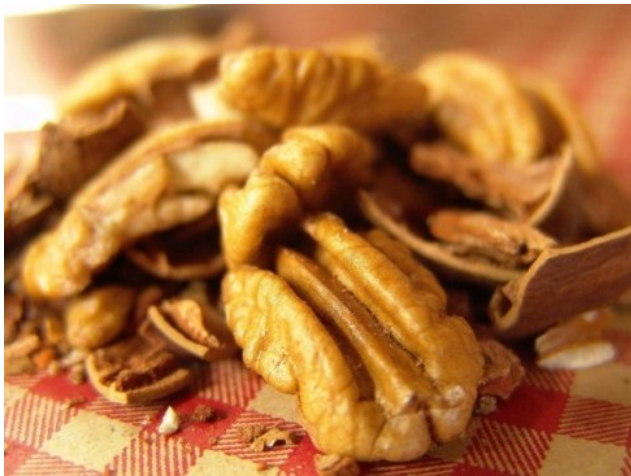
The Nut House 26677 S Hwy 66 Claremore, OK 74019

The Route 66 Pecan & Fun Fest offers something for all ages. Take a detour off historic Route 66 in Claremore and head to The Nut House for a car show, a craft show and entertainment for the kids. Concessions will be available all day. Visitors can enjoy live music in the afternoon.