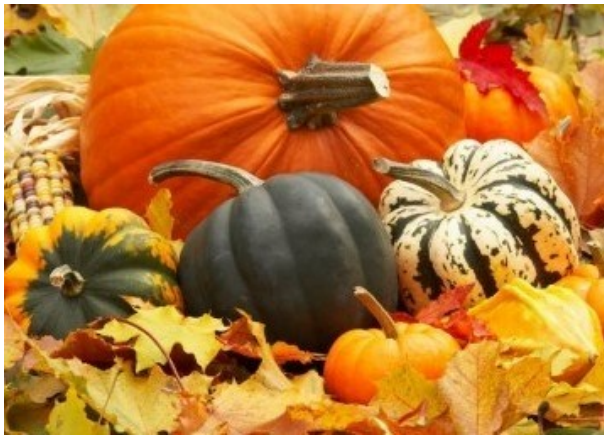
Holy Ghost Catholic Church 120 W Sequoyah Vinita, OK 74301

Vinita's annual Oktoberfest will entertain visitors with a variety of live music, delicious food and plenty of booths filled with arts and crafts. A celebration of German culture, Oktoberfest pays tribute to the season with children's games, beautiful fall foliage, pumpkins and scarecrows. Bring the kids for pony rides and endless family-friendly entertainment, or simply enjoy luscious fair food. This fall celebration has everything from German bratwurst with sauerkraut to savory turkey legs. Come and enjoy grilled hamburgers, hot dogs, fried fish and hushpuppies, taco salad, nachos, funnel cakes, cotton candy and shaved ice, as well as homemade pies, cakes and cookies.