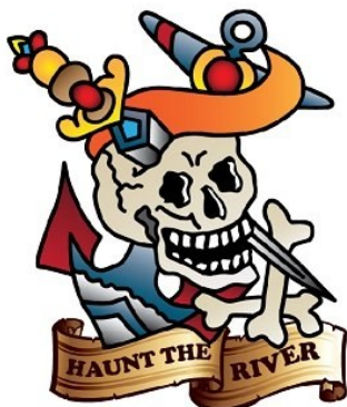
Oklahoma River Cruises 701 S Lincoln Blvd Oklahoma City, OK 73129

Oct 3-5; Oct 10-12; Oct 17-19; Oct 24-26; Oct 31