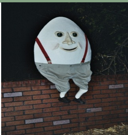
Spring Creek Park, Arcadia Lake 7200 E 15th St Edmond, OK 73034

Kids and their parents are invited to walk through the not-so-scary Storybook Forest around Edmond's Arcadia Lake to collect candy from storybook characters and to see wonderful storybook scenes. Other festivities in Storybook Forest include a hayride, a game area and a campfire setting for roasting marshmallows, warming up with mugs of hot chocolate and listening to stories being read aloud. Adults purchasing a children's ticket are admitted free.