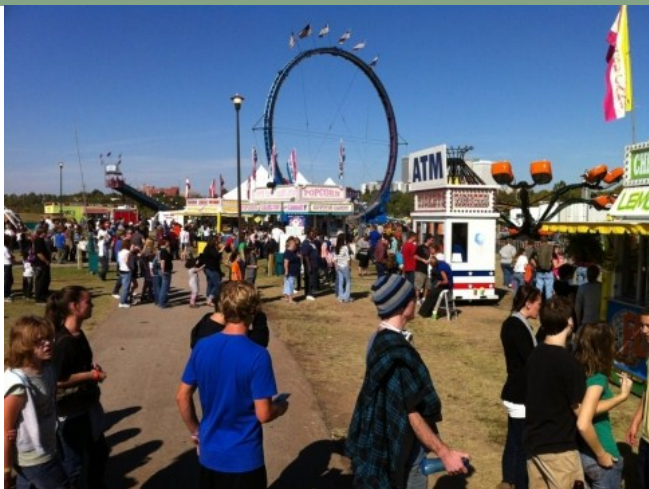
River West Festival Park 2100 S Jackson Tulsa, OK 74105

Voted "Best Festival" by the Urban Tulsa Weekly, Tulsa's Oktoberfest offers fun for the whole family. Visitors to this Oktoberfest celebration will enjoy delicious food, refreshing beverages, live music straight from Germany and much more. Sit down and savor authentic German beer imported from Munich, or enjoy a glass of wine while listening to the sounds of live Bavarian-style entertainment. Other festivities include polka dancing and rows of booths filled with art and crafts. The festival also offers authentic markets where visitors can find all kinds of German items such as stained glass, steins, Pilsner glasses, beads and novelties.