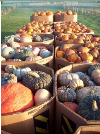
Shepherd's Cross 16792 E 450 Rd Claremore, OK 74017

Join the celebration of rowing, kayaking, dragon boating and stand-up paddle boarding at the Oklahoma Regatta Festival. This four-day event offers plenty of fun for the whole family, as you witness more than 1,000 rowers from across the country competing in masters, collegiate, juniors and corporate racing with 4,000 meter races during the day and 500 meter supersprints under the lights at night. Watch the popular Oklahoma City University Head of the Oklahoma racing, or just enjoy the festival's other events, which include an art show, food booths, live music, a children's area with inflatables, wine garden and more. Oct 03, 2013 to Oct 06, 2013