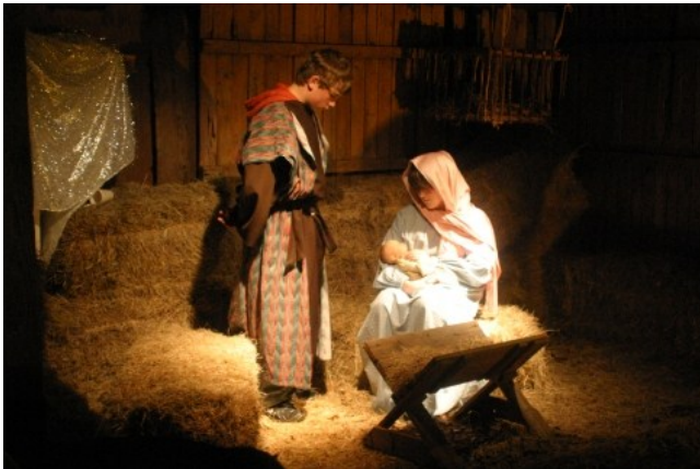
5100 SE 33rd St Edmond, OK 73013

The Boys Ranch Town Drive-Thru Christmas Pageant has been an annual gift from Boys Ranch Town to the community and visitors from all over the state of Oklahoma since 1971. This living nativity presents the Boys Ranch Town residents, staff children and live animals from the ranch as they work together to depict the life of Jesus Christ including his birth, death and resurrection. Head to Edmond this December for an unforgettable evening of the miracle of Christmas.