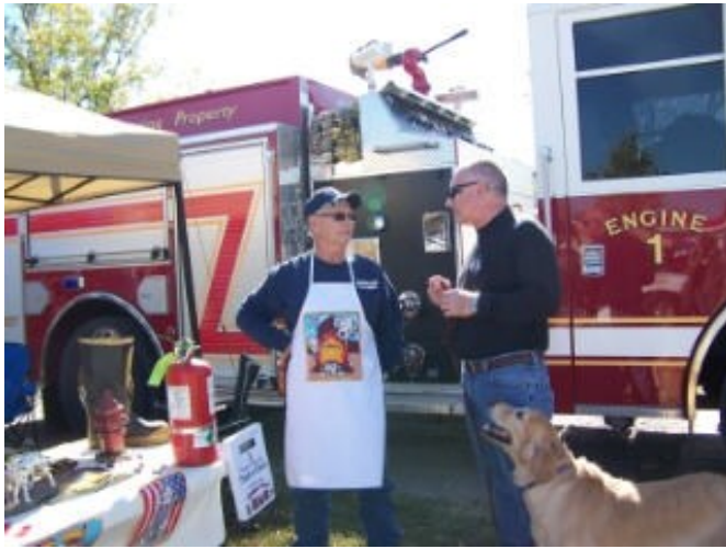
Centennial Park 2nd Ave & Main St Stroud, OK 74079

Enter your best recipe or be a taste-tester at the Mother Road Chili Cook-Off in downtown Stroud. Participants will cook the chili off-site, then bring it to the event to be evaluated by a panel of judges and tasted by the public. Judging will be divided into three divisions: chili with beans, chili without beans and non-traditional chili, which is any chili that is not the traditional red variety.