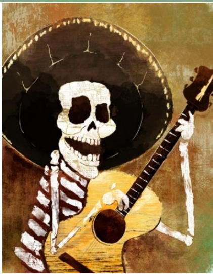
Brady & Detroit Tulsa, OK 74120

The Dia De Los Muertos (Day of the Dead) Arts Festival in Tulsa is a celebration of Hispanic culture and remembrance of loved ones who have passed. Make your way to Living Arts of Tulsa in the Brady District to attend lectures and workshops, watch Mexican dancing and a browse unique items for sale in the artist's market.