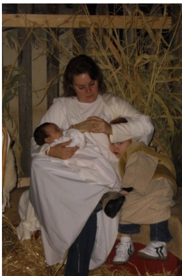
Shepherd's Cross 16792 E 450 Rd Claremore, OK 74017

Come to this Living Nativity event at Shepherd's Cross, a working farm and Christian mission, to walk through a living, interactive nativity depicting the birth of Jesus Christ. Live animals in the nativity scene include sheep, mules, donkeys, chickens, guineas and horses. Shepherd's Shop will also be open during the event and will feature farm-fresh pecans, Amish pecan candies, baked goods and hot beverages, as well as festive Christmas and sheep-related gifts. A wide variety of unique Christmas items and handmade items will be available this Christmas season.