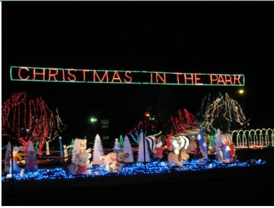
Ackley Park Elk City, OK 73644

Visit Elk City's Ackley Park this holiday season to celebrate Christmas in the Park. This event features millions of lights and hundreds of festive displays every night, as well as plenty of Christmas music. On Friday and Saturday nights, bring the kids out to visit Santa's gift shop, ride the Candy Cane Train and go 'round on the Centennial Carousel. Enhance your tour of the lights with a ride on an English double-decker bus or a horse-drawn wagon. Expect special appearances by Santa and Mrs. Claus.