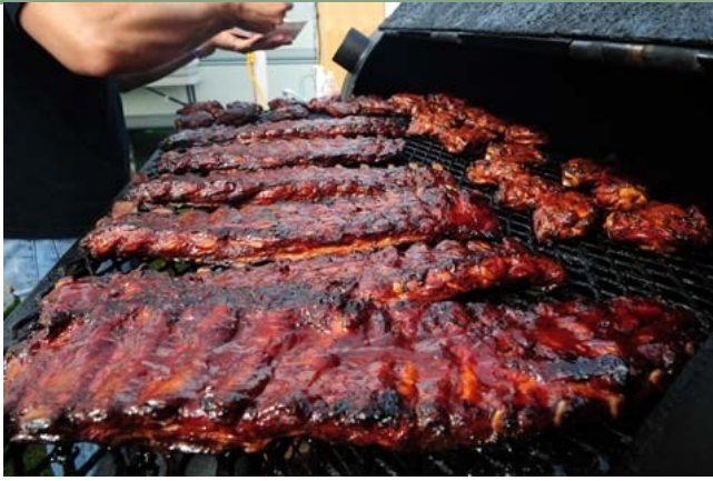
Blue Dome Entertainment District Tulsa, OK 74120

Come and enjoy the Art of BBQ, an annual Tulsa celebration held in the Blue Dome Entertainment District. This fun two-day event features 50 barbecue teams vying for top honors. Bring out the whole family to sample delicious Oklahoma barbecue and cast your vote for the People's Choice award at this Kansas City Barbecue Society sanctioned event. After you've had your fill of barbecue at the Art of BBQ, take a walk around the Blue Dome Entertainment District and find cool places to hang out like Arnie's Bar, McNellie's Public House, Dilly Deli, El Guapo's Mexican Cantina and Woody's Corner Bar.