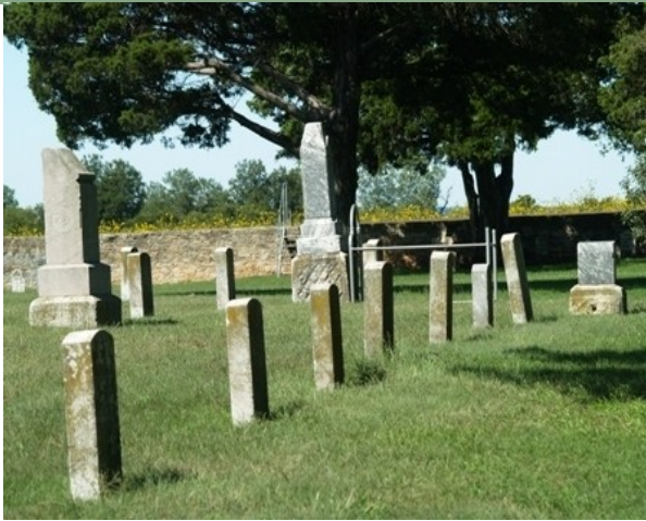
Historic Fort Reno 7107 W Cheyenne St El Reno, OK 73036

Come along on an exciting and spooky ghost tour at El Reno's historic Fort Reno. This ghost tour includes plenty of ghost stories and demonstrations by paranormal studies groups. Take a walking tour of this historic area and listen as knowledgeable guides provide information on Fort Reno's haunted past and present. Fort Reno, which began as a military camp in 1874, was established for the protection of the Cheyenne and Arapaho tribes. Fort Reno is also famous for the African American Buffalo Soldiers that were stationed there, its role in the Land Run of 1889 and as an historic location for German POWs during WWII.