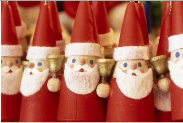
JM Davis Arms & Historical Museum 330 N JM Davis Blvd Claremore, OK 74017

The Christmas Arts & Craft Show in Claremore is your one stop shop for that special someone on your list. Homemade jewelry, candles and other crafts will be available. Browse rows of vendor booths or check out the JM Davis Arms & Historical Museum exhibits. The museum is the world's largest privately owned museum and is known for its collection of weapons. The Christmas Arts & Crafts Show is guaranteed to have something for everyone.